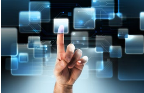
Creative processes for the development of new business domains and products